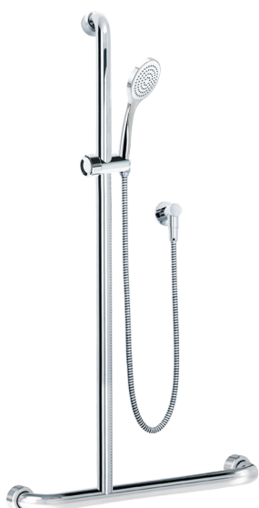
Drawn LH (Left Hand)